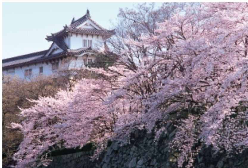
Luxuriant Cherry Blossoms in Full Bloom (in Himeji city)