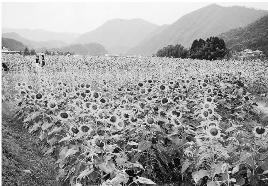
Sunflower field (in Nankou - cho, Sayo - gun)