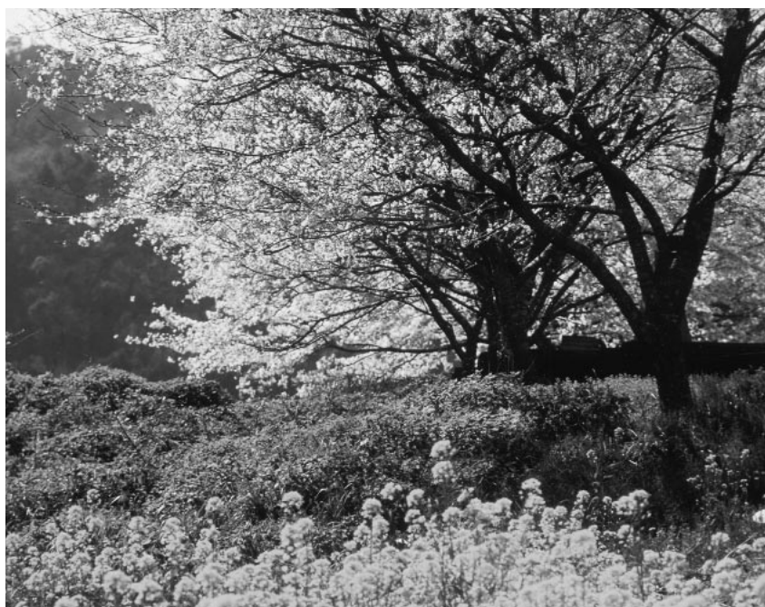
Cherry blossoms and Rape blossoms (in Mikazuki-cho, Sayo-gun)