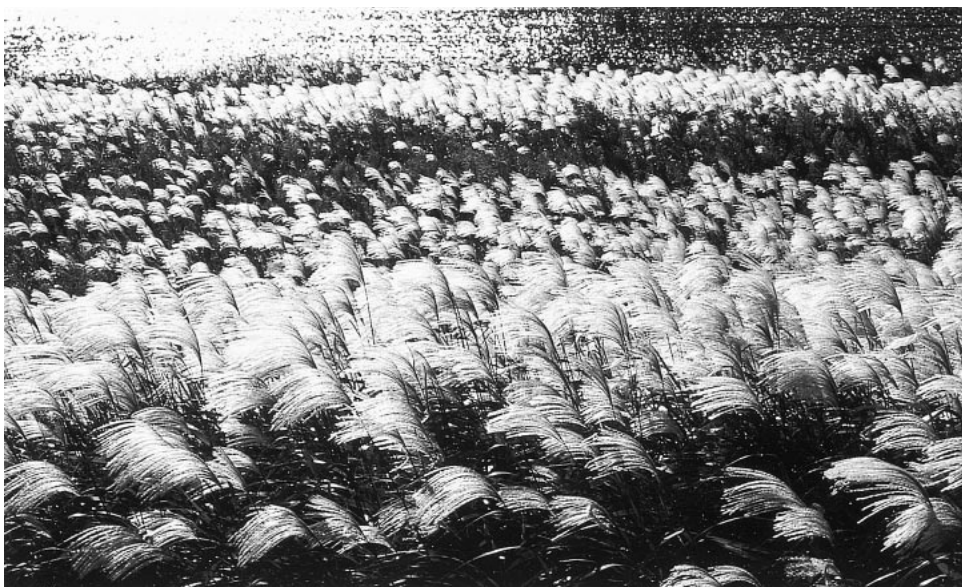
Japanese Pampas Grass “Susuki” (by the Chikusa-river Beach, Kamigori-cho)

In every autumn, “Susuki” will be beautifully swaying in the cool and refreshing wind.