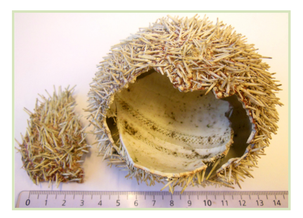
Fig. 1. Shell with spines of Echinus esculentes

All over the animal kingdom, biomineralization is employed to form durable yet lightweight materials such as bones, teeth and mollusk shells. Studying the internal structure of these materials can give us an important insight into how these materials are formed and how we can use nature's design strategies to improve man-made materials. For this experiment, we focused on the micro- and nanostructure of spines of three different sea urchin species from different habitats and thus different adaptations to their environment: i) the edible sea urchin ( Echinus esculentes ) and ii) the heart urchin ( Echinocardium cordatum ) and iii) the purple sea urchin ( Sphaerechinus granularis ).